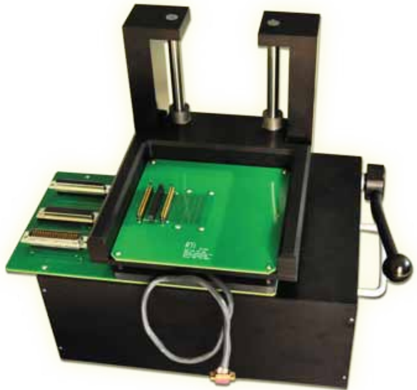
Example of the fixture with pogo pins in both the base and lid

4 inches of vertical travel distance allows for plenty of room to interchange components while maintaining precision alignment as the fixture is closed.