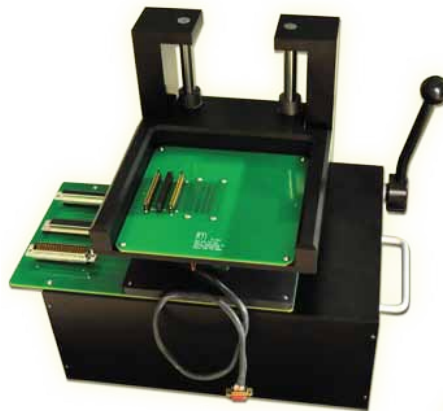
751 during the lid opening process